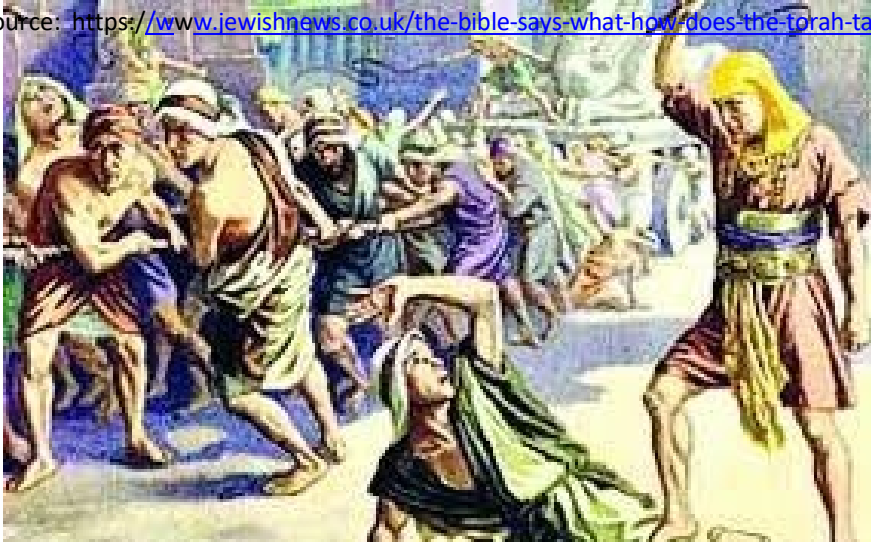
“Ye thought evil”