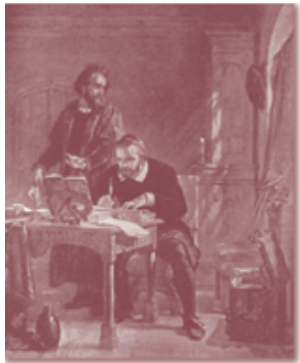
Tyndale undertakes the hazardous task of translation

So we wait about two hundred years when God raised up a young man down in Gloucestershire named William Tyndale (1494–1536), and really I think William Tyndale was perhaps one of the greatest men who ever lived. Tyndale had a wonderful understanding of Hebrew and Greek, and he had an ambition. Lots of young people have an ambition, something they would like to do. This was his ambition: he said, 'If God spares my life, ere many years I will take care that a ploughboy shall know more of the Scriptures than you do.' 2 So he started putting the Bible into English from the original language texts.