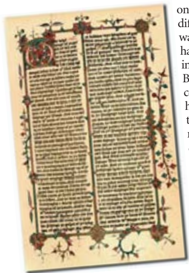
A page from a Wycliffe Bible

one or two difficulties! One was that printing had not been invented, so the Bible had to be copied out by hand and it took about ten months to copy out the Bible. Actually, one or two of them are still in existence. If you bought one, it would be about £40 in those days, which would be