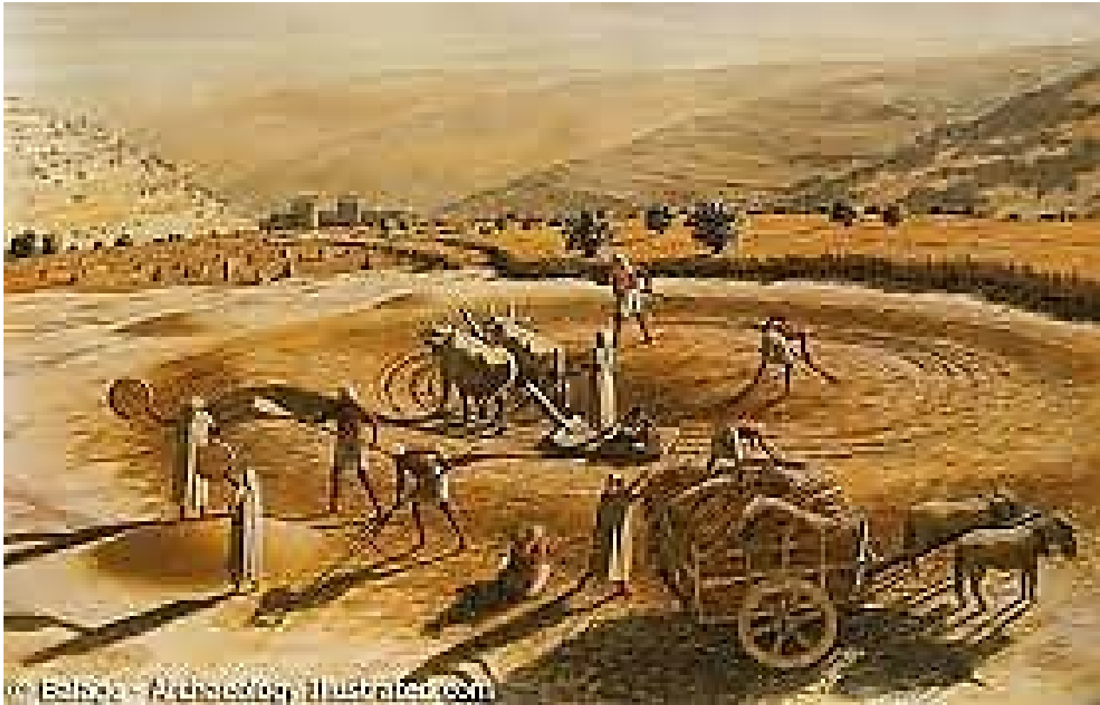
A threshing floor

(8) As the Angel of Death was preparing to destroy Jerusalem, the Lord stopped the destruction. The Angel of Death was at the threshing floor of Araunah the Jebusite. (2 Sam 24:16)