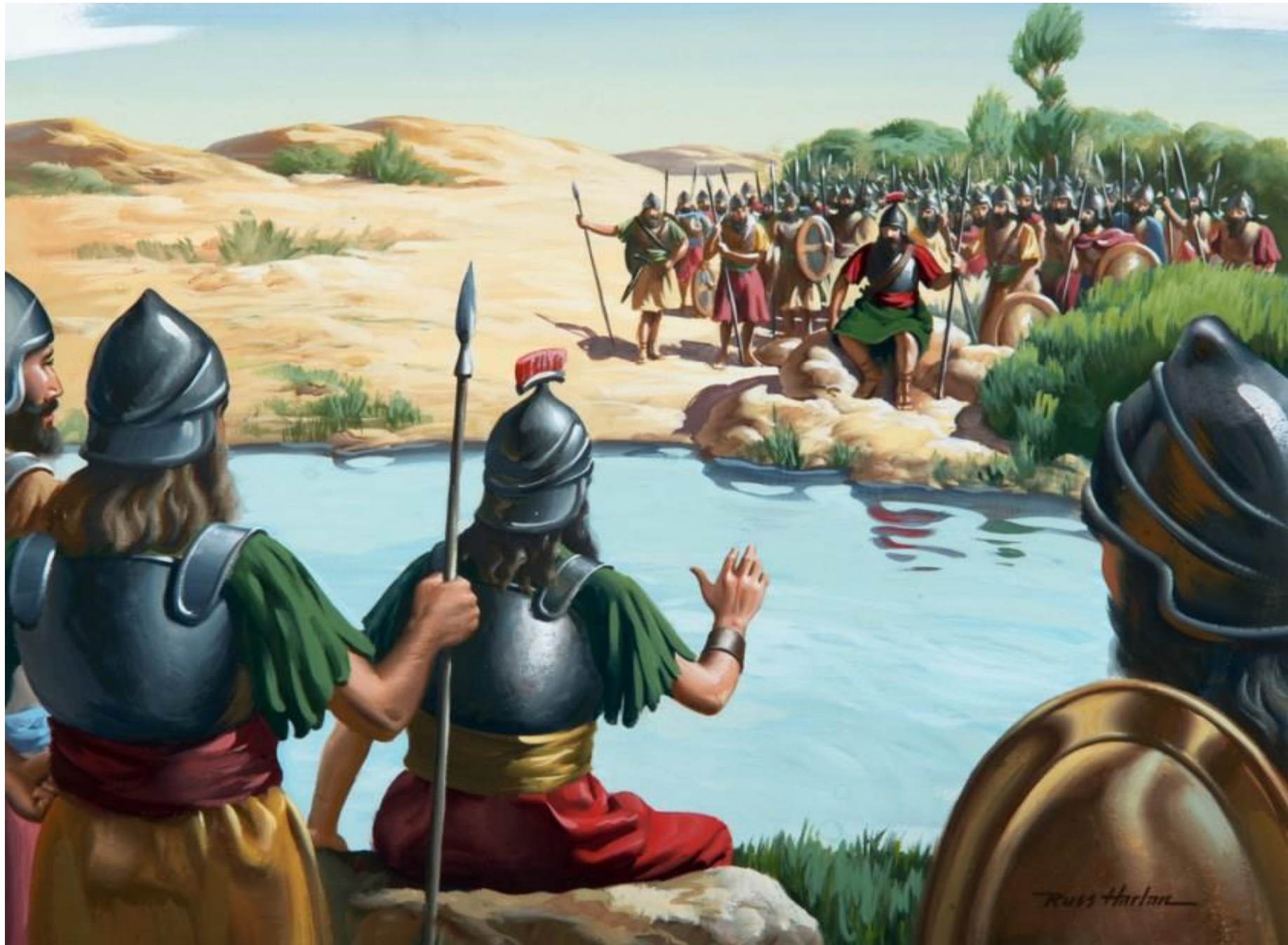
Joab and Abner met at the pool of Gibeon

https://i0.wp.com/jamesjackson.blog/wp-content/uploads/2022/04/Pool-at-Gibeah.jpg?resize=840%2C672&ssl=1