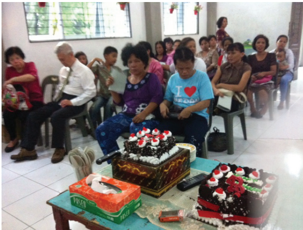
Congregation of New Light Blind Church

God has been so good, blessing the ministry with more and more born again blind brethren for the past two years. We are confident that God will continue to work mightily in the hearts of the blind brethren and to bring them one by one to salvation in Jesus Christ. We pray that the Spirit of God may continue to help them grow in the Lord and experience God in their life each day.