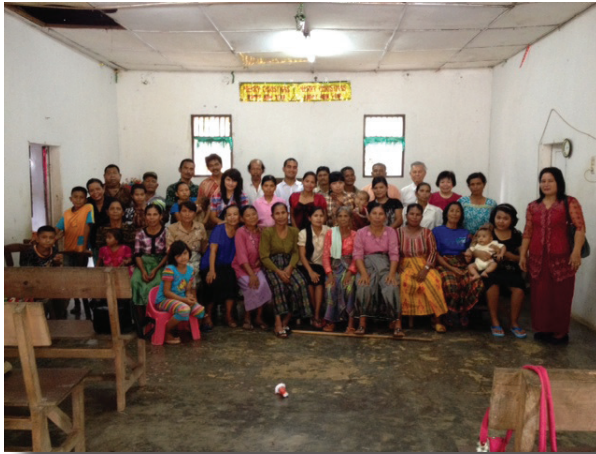
Congregation of Kutabaru B-P Church