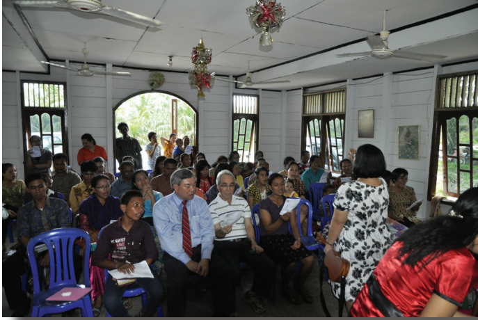
Worship Service at Libo B-P Church

On this visit, the team also donated metal plates and plastic chairs to the church. That same afternoon, the team returned to Pekanbaru and departed the following morning for Singapore via Batam. It had been an enriching experience and the team would like to thank God for the privilege of bringing joy to the people of Libo School and Libo B-P Church.