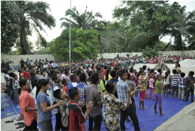
Excitement before the start of campfire at Libo School