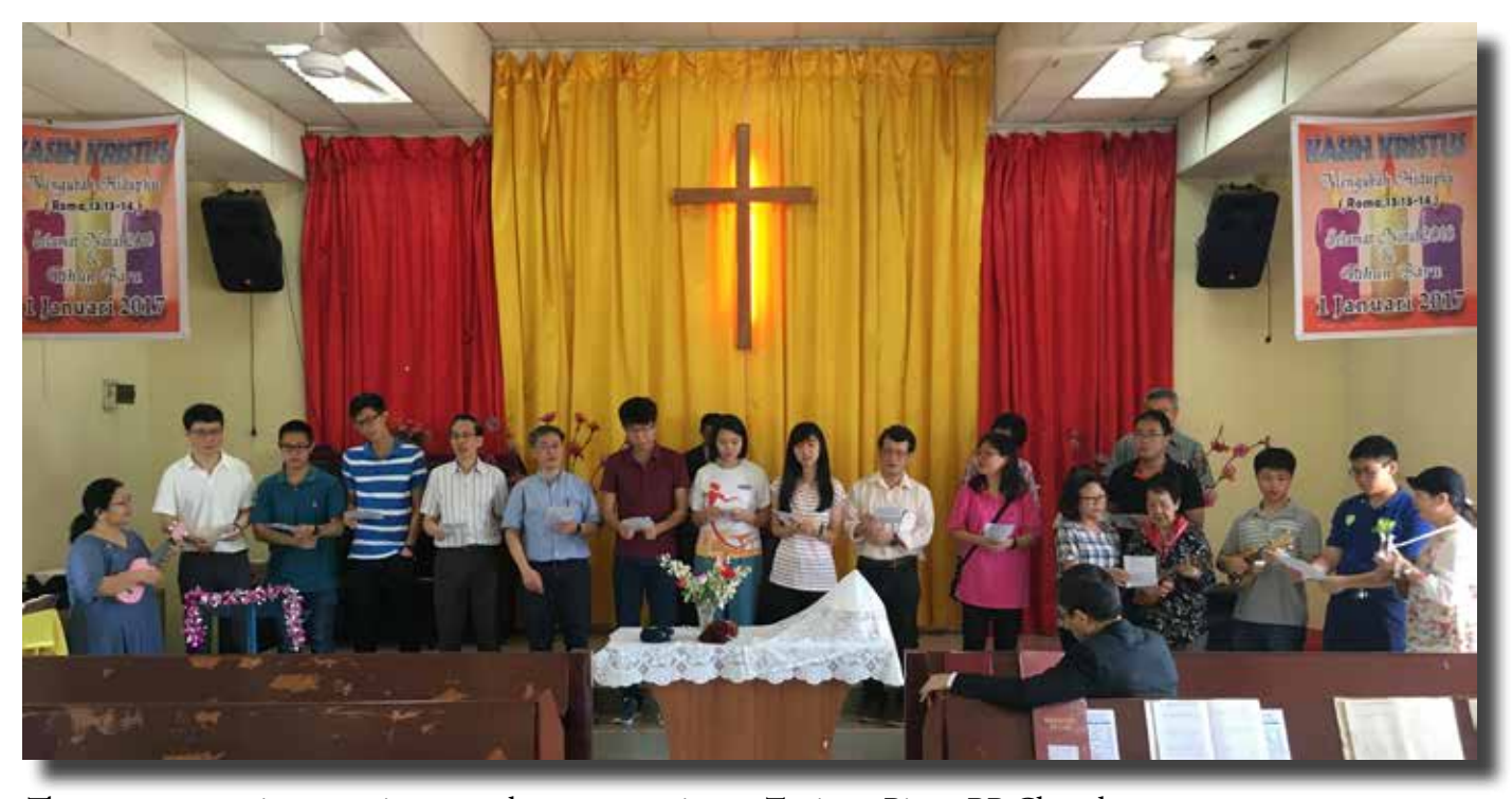
The team presenting song items to the congregation at Tanjung Piayu BP Church