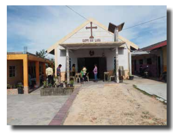
Batu Aji BP Church