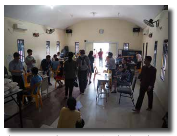
The sanctuary of Batu Aji BP Church where the medical clinic was held at