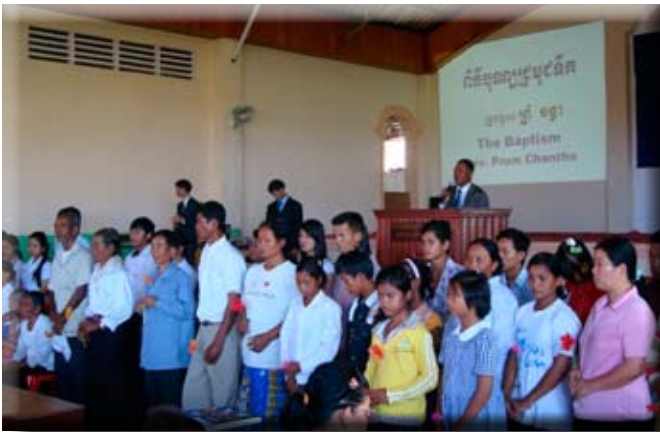
The 63 members who were baptized

5. In obedience to the Great Commission of our Lord Jesus Christ, we need to train His servants to spread the Gospel for the salvation of souls and to build up the believers in the faith. Please pray: