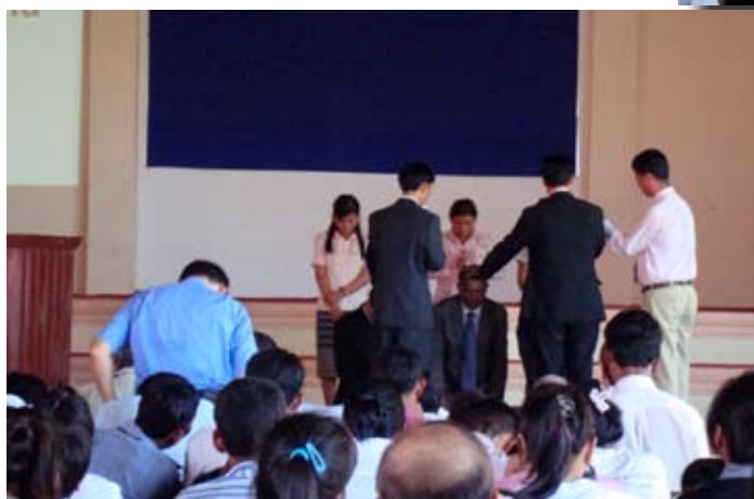
Ordination of the three pastors