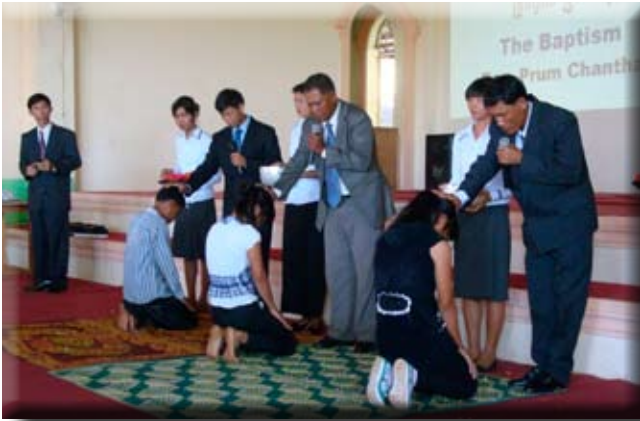
Baptisms by the three pastors