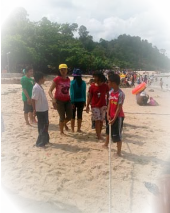
Playing a game on the beach