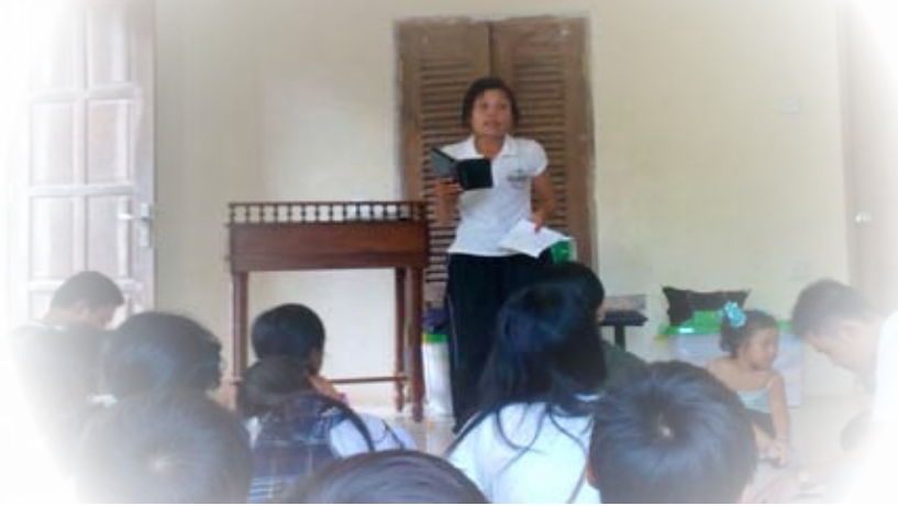
A sister leading in singspiration at the camp.

We thank the Lord that many at Batu Aji have grown in their commitment to God's kingdom and would like to join the church. Because of this, catechism classes have been arranged to prepare them for transfer of membership and reaffirmation of faith at the Church anniversary in October 2010. Some infants will also be baptized at this service.