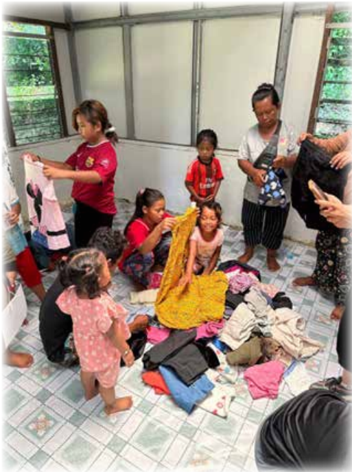
On Paku Island: Distribution of donated clothes to the residents