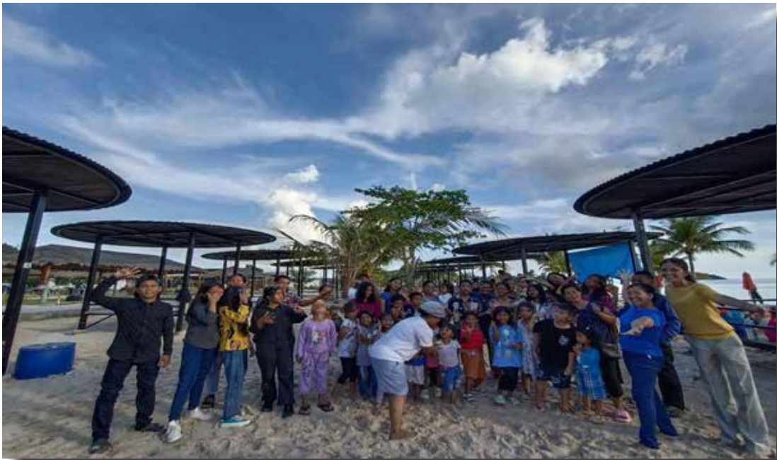
Easter celebration for Sunday school children as well as recreation.

Hopefully, this ministry will continue to grow, and we seek prayer support from all of us for this task of preaching the Gospel. Glory to the Lord Jesus. Amen.