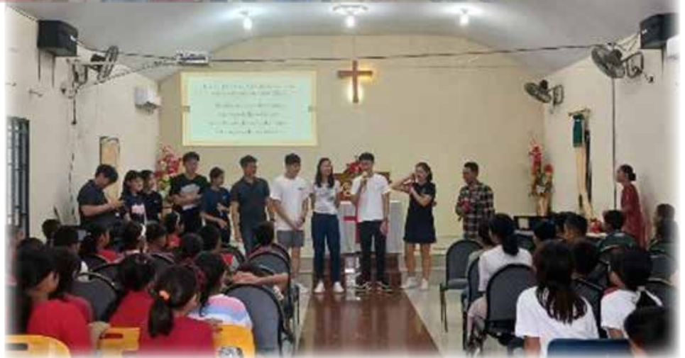
Vacation Bible School 2023