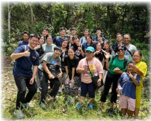
Mission team taking a group photo in Paku Island.