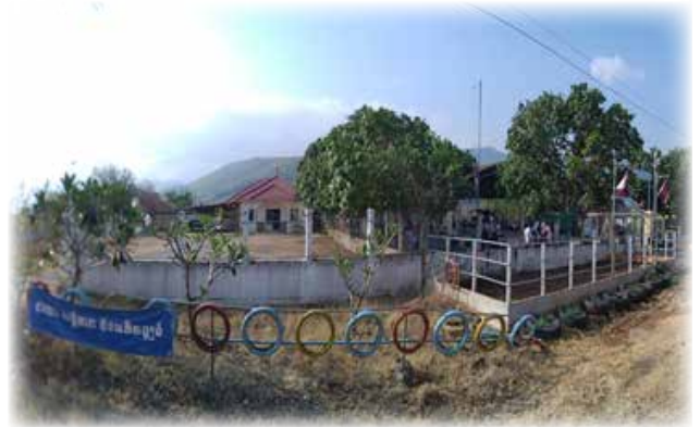
External View of Pailin Church & Primary School