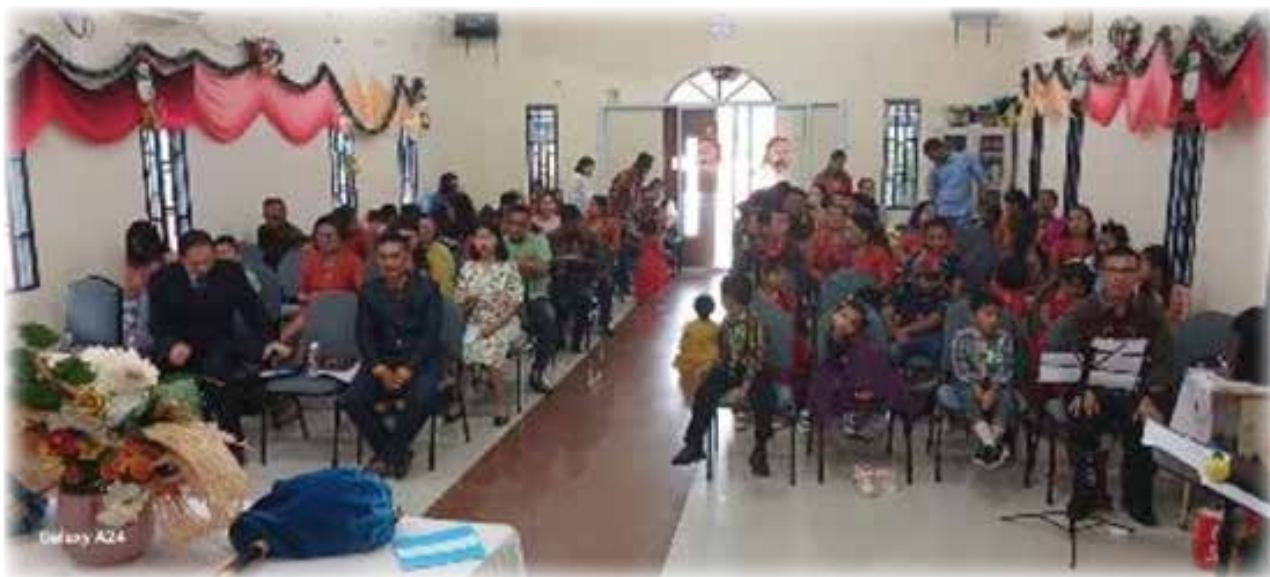
Worship service with students from New Life School

Praise God for all His great grace and love in the life and ministry of the GAPPI church. We are grateful for all ministry activities at the GAPPI Batu Aji church which run well every year, be it in corporate worship, family worship, prayer meeting, and fellowship groups. We are thankful for special events that can be used as good opportunities for preaching the Gospel and the truth of God's word, especially the combined events such as youth combined fellowship, ladies combined fellowship and other events. We are grateful for the good cooperation with the New Life Foundation in preaching the Gospel to children, one event that is held every year is the Vacation Bible School which will also be held this year. We are thankful for the support of prayers, funds and energy from fellow believers from Life B-P church Singapore who also took part in the ministries held at the GAPPI churches in Batam, especially at GAPPI Batu Aji. May God be glorified in all ministry activities in His church.