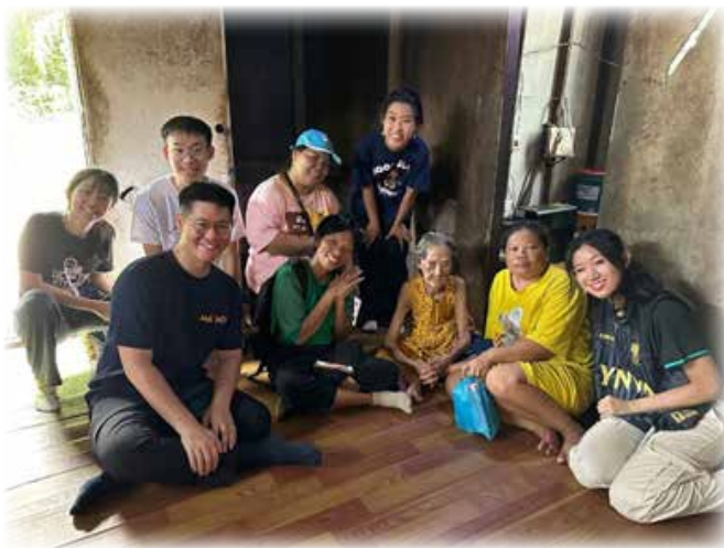
Island Door-to-Door Visits: The team visited the oldest elder (centre of photo), aged 130 years old, living on Paku Island.