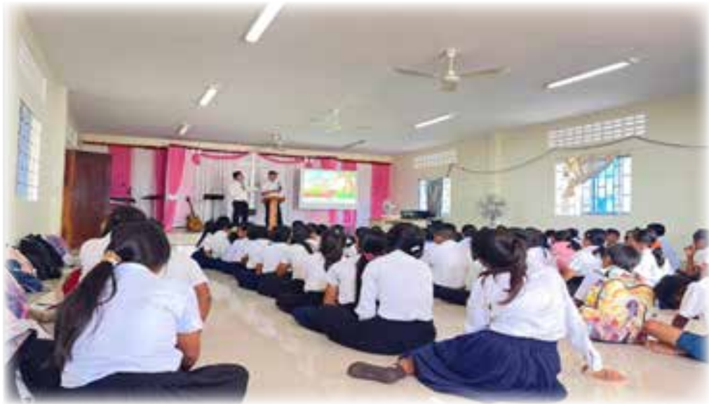
Gospel Presentation to Grade 4-6 Students in Pailin