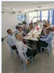
Lunch Fellowship in Evangel BP Church, Malacca