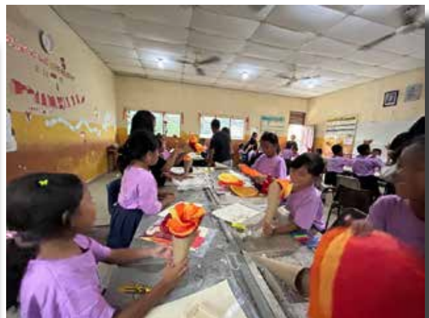
Students finishing up on their glowing torch craft

For the first art and craft session, less time was available as we started late due to the rain and the students and helpers were not that familiar with the art and craft yet. Thank God that the P5 and P6 could eventually finish their crafts and subsequent sessions with the younger children could be smoother.