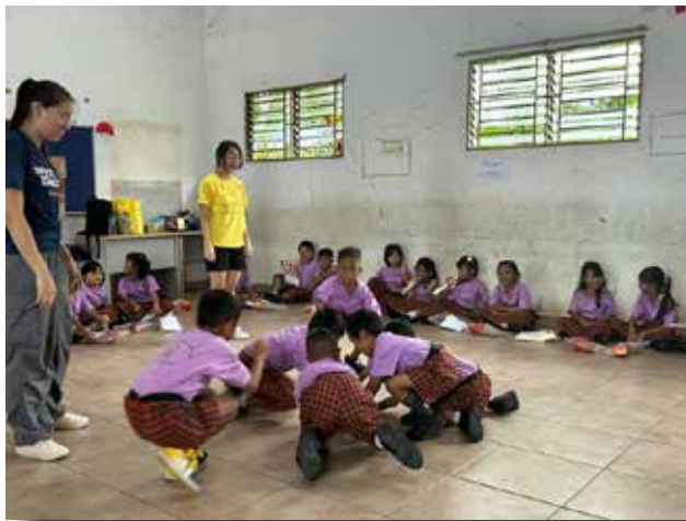
Students having a fun time playing the games