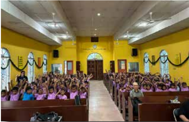
Students enthusiastically doing the actions and singing during the singspiration

playing to accompany the students' singing. This gave a fresh experience for each of the three times that this session was held.