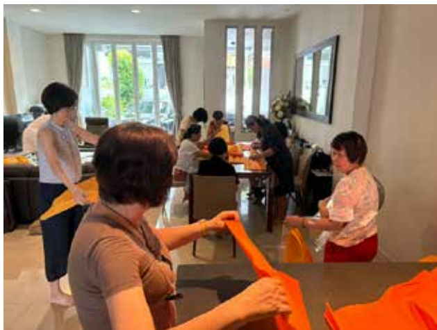
Ladies Fellowship sisters coming together on Vesak day to prepare Art and Craft materials for over 300 students

The team had a meeting on 17 May (Friday) in church, where we finalized roles and practised the singspiration songs, and had briefing of games and art and crafts in our respective groups.