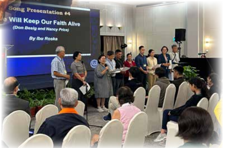
Song presentation by our Missionaries, "We Will Keep Our Faith Alive"