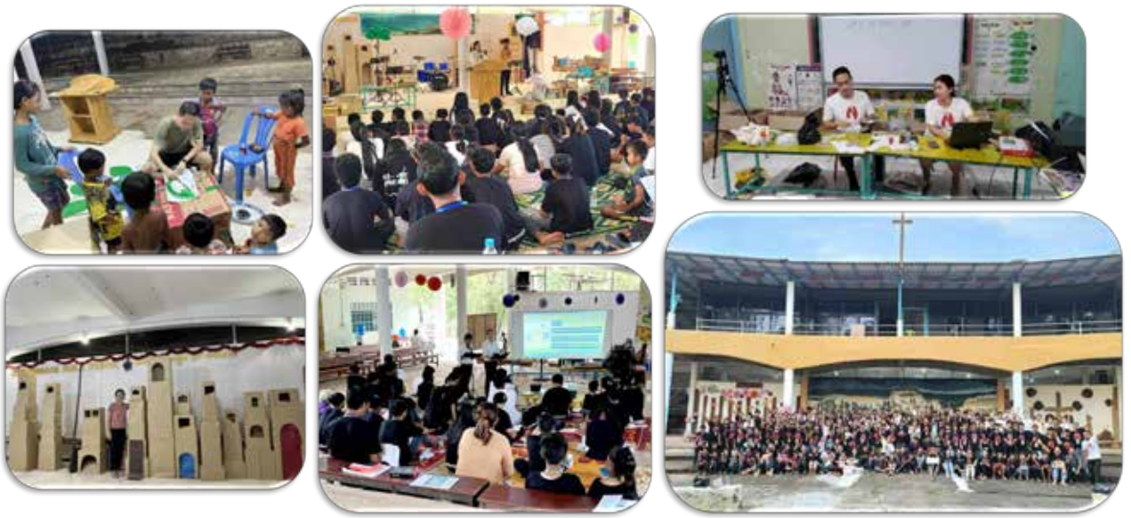
KBS Bible Camp

3) In December, we had the opportunity to work together with Life Church's mission team for the first time since we were commissioned. The mission team visited KBS with various lessons and programs for Bible students and children. Bible students shared many thanksgiving testimonies as they learned many the biblical lessons from mission team, and KCS children were able to learn many bible stories and enjoyed the crafts through VBS program.