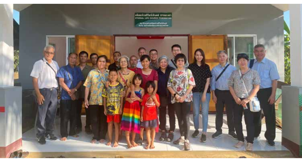
Fellowship with Pastors of the Mountain churches in ELC Pangmayao