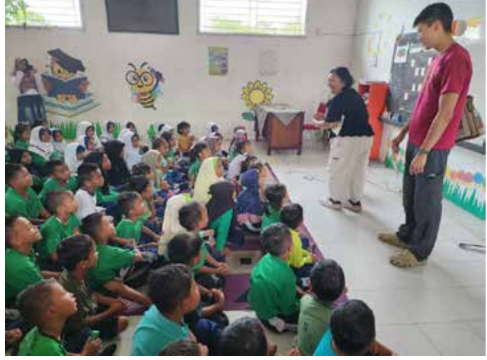
Medical talk with bonus Gospel!

the stories. Besides their lack of knowledge of the Gospel, there was also something disheartening we noticed while conducting the children's ministry. Many of the children seemed obsessed with us, treating some of our team members like celebrities. It was a sad reminder of how the culture of celebrity worship that has been fuelled by social media has left them empty and hungry for