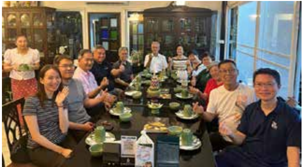
Fellowship dinner at the end of the Medical Mission