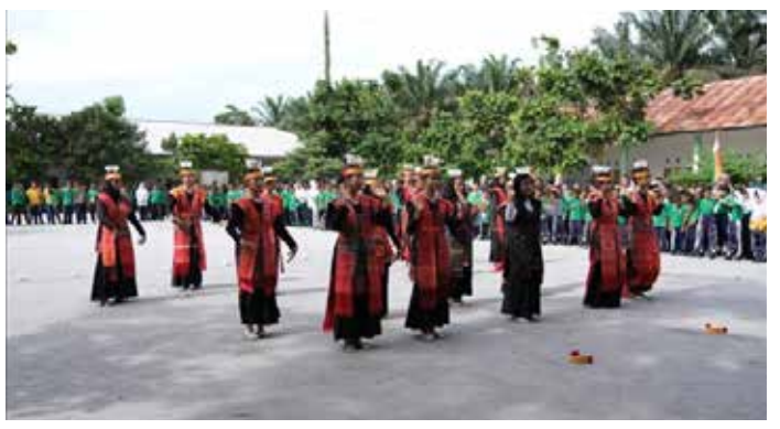
Dance Performance at Cornerstone

Under the sweltering sun, our children's ministry team proceeded to conduct station games for 400 excited children. We organized activities such as the Standard Obstacle Course (SOC), Dog and Bone, and