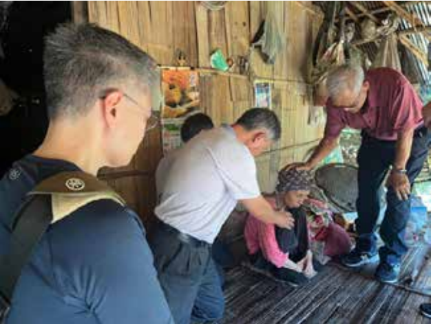
Praying for the physically infirmed who could not attend the clinic