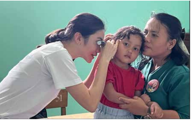
Medical Examination at Cornerstone