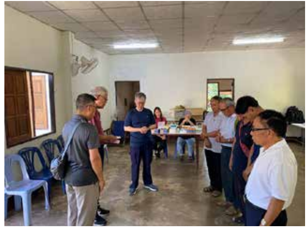
Elder Clement prayed for the Pastors of the Mountain Churches

Most of the patients sought treatment for back pain and knee pain as they work as farmers and have to engage in physical labour in the fields to earn their living.