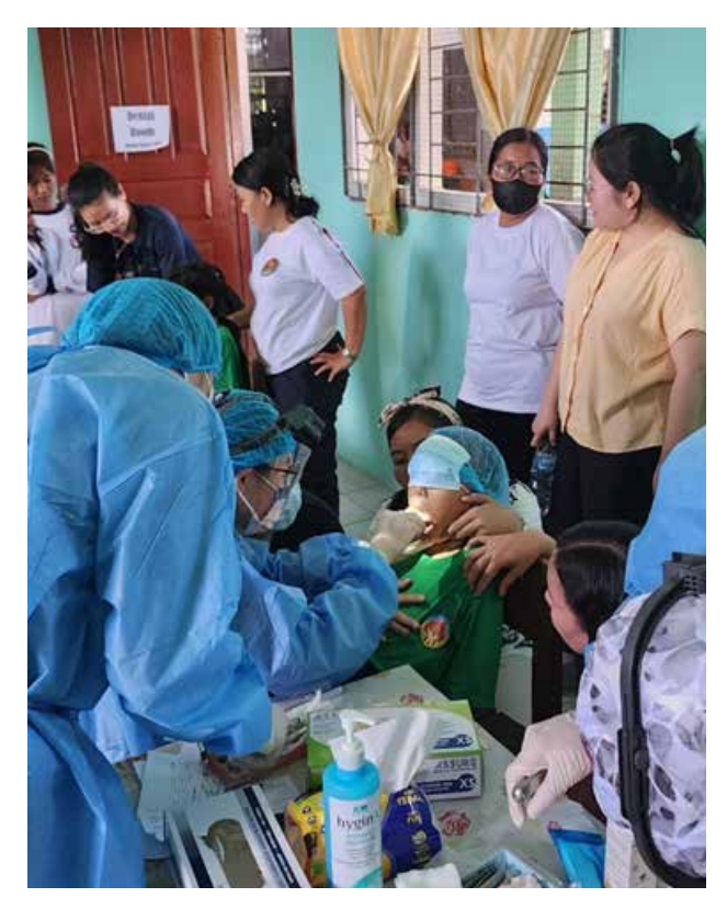
Dental Treatment at Cornerstone