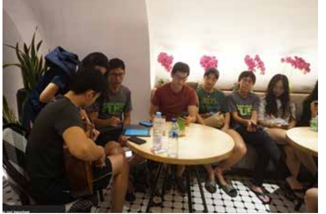
Worship and Debrief

Upon arrival at Cornerstone School for our second day of ministry, we were warmly welcomed with a special morning assembly in commemoration of the school's anniversary as well as our visit there.