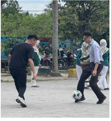
Ronaldo vs Messi

As we boarded the bus and headed off to dinner, we were treated to the beautiful sight of God's creation in all its incomprehensible majesty. On the left side of our bus, we were blessed with the view of an ethereal sunset, coruscating rays streaking across the vermillion sky; God's masterful brushstrokes gilding the end of the day. This was juxtaposed with the right side of the bus, whereentire colonies of giant Asian flying fox bats glided overhead, cast against the ominous canvas of the umbral gray sky.