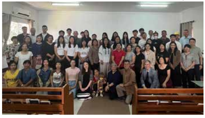
Lunch fellowship in ELC Chiang Mai after Service