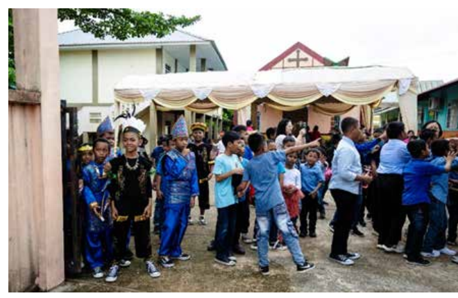
Selamat Datang: A colourful welcome

On the first day, the mission team took one of the first ferries out of Singapore in order to arrive at Batu Aji School by 9am local time to commence the Children's Ministry Programme. Upon arrival, the team was greeted by the emotional sight of 200 children gathered in traditional costume to perform a welcome dance. Echoing the thoughts of one team member, we were moved and wondered what we have done to deserve such generosity and outpouring of gratitude.