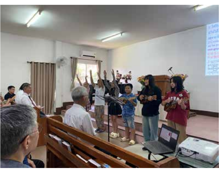
Ukulele and song item by the children