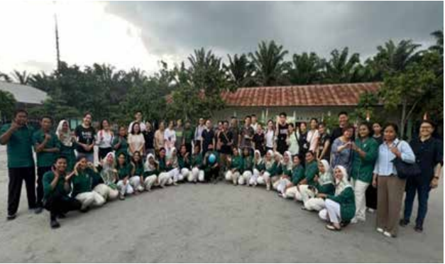
Groupshot at Cornerstone!

Due to the unexpectedly low patient numbers and the children leaving earlier than expected, we had a rare opportunity to take a short break in