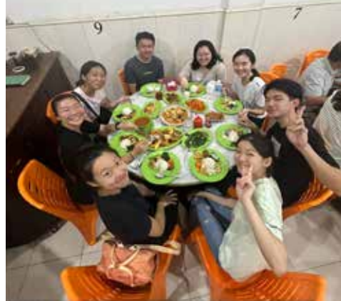
Dinner at the Restaurant

This was capped off by a special traditional performance by a troupe of secondary school students. It was a beautiful way to start our day, and we were greatly encouraged by the earnest and warm reception we received from the kids there.