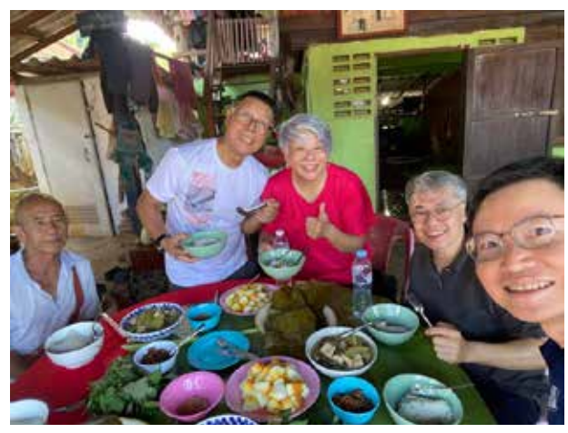
Enjoying the lunch cooked by the church members

see the ELC churches growing and the Pastors ministering to the people there. We are planning a team to support a youth ministry and Medical mission in October 2025 and look forward to more people to join us.