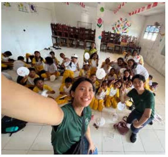
Craft at Libo School

something to worship. It revealed the pressing need for the Gospel in their lives, to show them that Christ is the only one worthy of worship, and the only one that can fully and truly satisfy them.