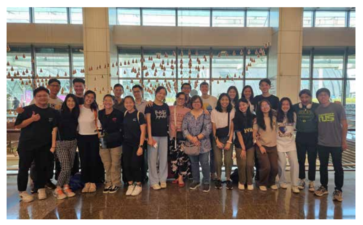
The Team at Changi Airport

Greetings in the name of our Lord and Saviour Jesus Christ!